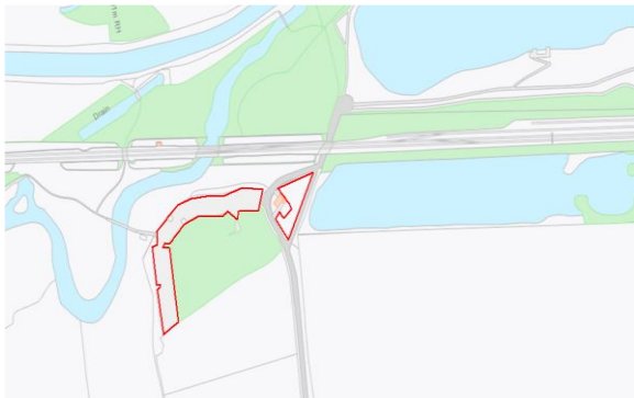
Map above showing dogs on lead area within main car park and catering area within Haysden Country Park.

No person may camp in any place within the Country Park unless specifically authorised in writing by the Council.