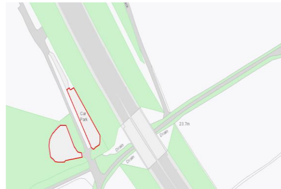
Map above showing dogs on lead area within Lower Haysden Lane Car Park.